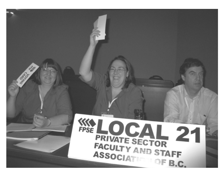
Delegates to the 2005 AGM.

address BC's skills shortage and the perennial lobbying for adequate post-secondary funding, as well as on bargaining-related issues. I offer here a summary of my more detailed reports that were presented to Council all through the year.