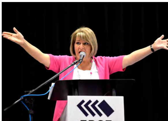
FPSE AGM 2016