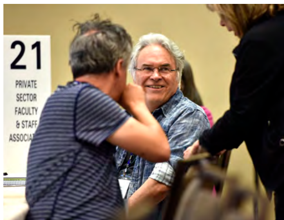
FPSE AGM 2016

Because of their contingent status, from time to time non-regular representatives find it difficult to consistently attend the meetings of the committee. There should be a way for locals to ensure that when their primary non-regular delegate cannot attend a meeting, an informed alternate is ready to step in. It is significant when a member misses a meeting because there are only two in a year.