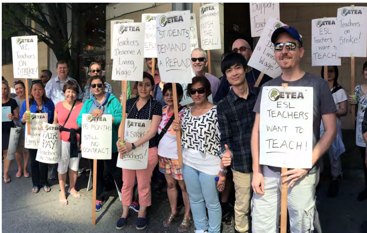
ETEA Local 9 picket line, 2016

FPSE and ETEA called for a stronger regulatory framework with a mandatory registration process. There is a clear need for greater transparency and accountability, yet the government opted for a voluntary process that does little to protect students. Third parties, such as agents, are not part of the framework at all, so in the event they mislead students, they won't be held accountable – and neither will the school. The regulations only require an ESL school to register if they want to offer student visas. Since many of the schools attract students on tourist visas, voluntary registration leaves thousands of students unprotected in the event of a school closure. With stronger regulations, students at VEC would have had some protection after the employer unexpectedly closed down that school during ETEA Local 9's strike last summer. As it was, the students were left without redress for the thousands of dollars they'd paid in tuition fees.