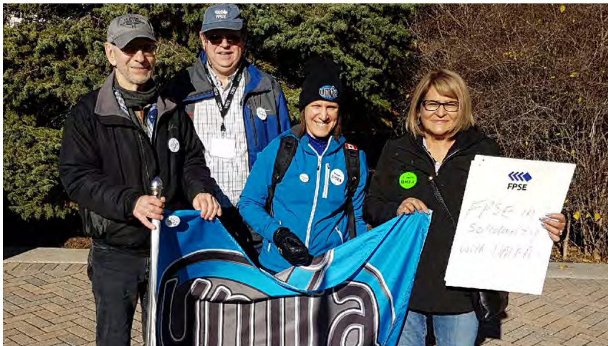
UMFA picket in Winnipeg, 2016

I attended the MoveUp picket line in August as well, joined by several FPSE staff, offering support and solidarity with these workers as they struck for a fair contract in a dispute with their employer, the BC Nurses' Union. The employer tried to force concessions in health benefits and sick leave. The Unifor members, the staff representative bargaining unit, also struck. Both unions eventually reached settlements with the employer, but after such a long, ugly dispute, the wounds will take more time to heal.