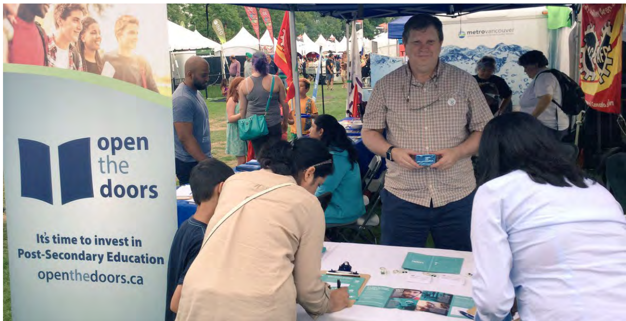
Surrey Fusion Fest, 2016

I have been pleased to continue FPSE's participation with the Public Education Network Society (PENS), which meets to discuss public education in BC and ways to protect it. PENS has focused its recent efforts on adult education, partnering with parent groups and SFU's Your Education Matters on a series of pre-election events, including "BC Public Education: Keeping the Covenant with Future Generations" in February, and another in March on "How School Funding Matters." We brought together the Coalition for Public Education a few times as well, to share information and resources about election strategies.