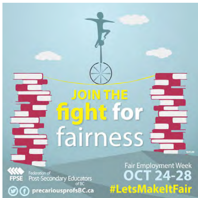
Precarious Profs shareable, 2016