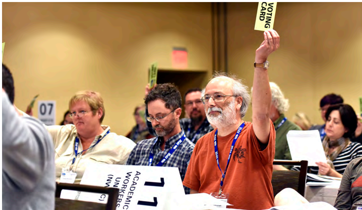
FPSE AGM 2016