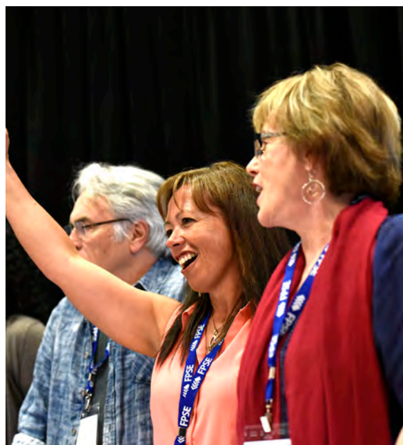
FPSE AGM 2016

The second survey was regarding educational technology from a PD perspective. As far as infrastructure goes, there is a huge disparity in classroom technology and support for using classroom technology across the various institutions. One interesting result: very few, if any, institutions offer training on the pedagogy of teaching in an educational technology enhanced mode. The survey also indicated there are workload issues, such as that release time is not being provided to develop or update online, blended, and hybrid courses.