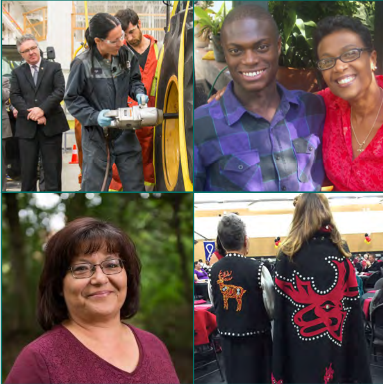
Post-Secondary Profiles, 2017

made to put FPSE and our important work on the public radar.