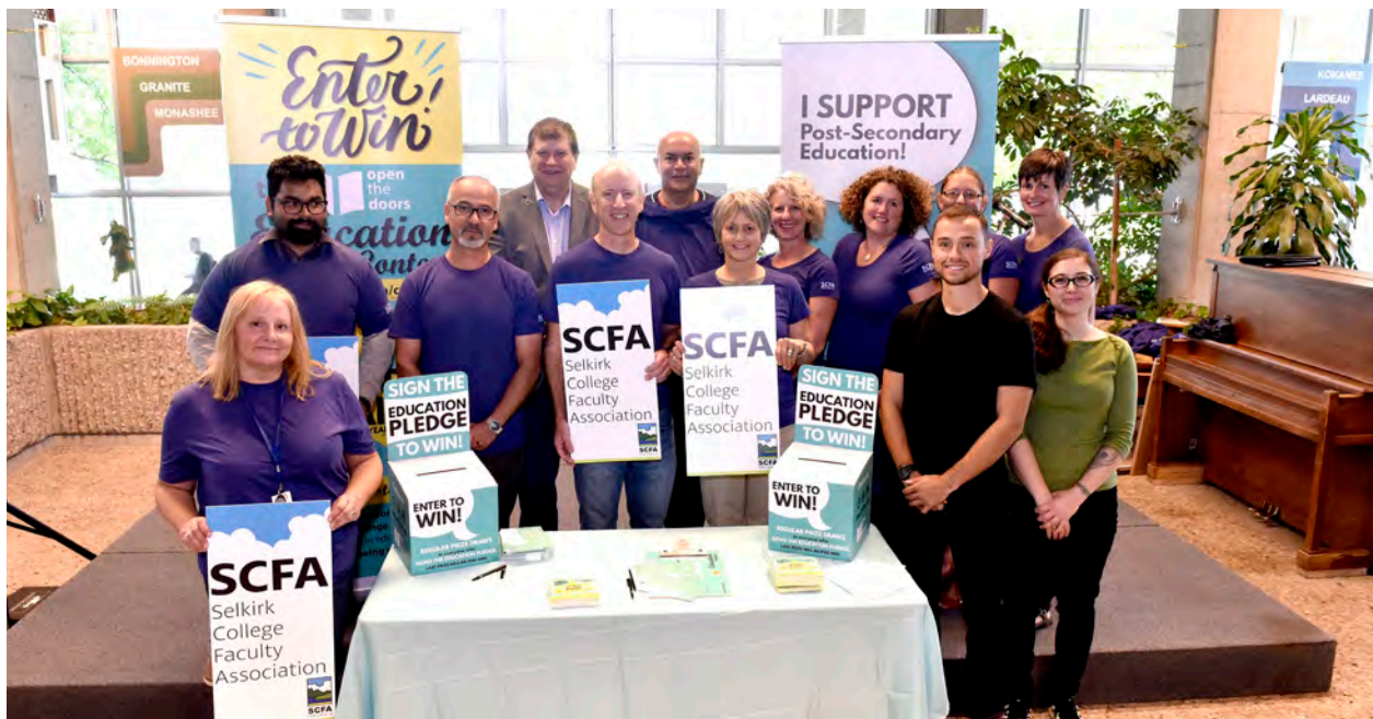
SCFA day of action textbook giveaway and affordability rally

In the New Year, we hit the ground running with a series of animated videos along with radio and print ads, focused on monthly themes of affordability and student debt (January), local impacts of cuts and closures (February), increasing investment in post-secondary education (March), voting for candidates that support public post-secondary education (April), and getting out the vote (May). Our strategy for the months leading up to the election involved a combination of paid advertising, generating earned media, and engaging with